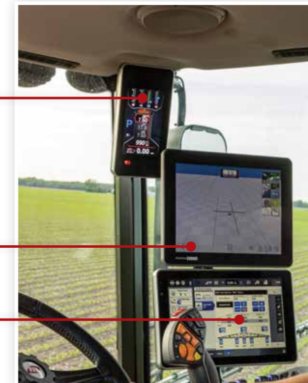
Miller SprayView12® display